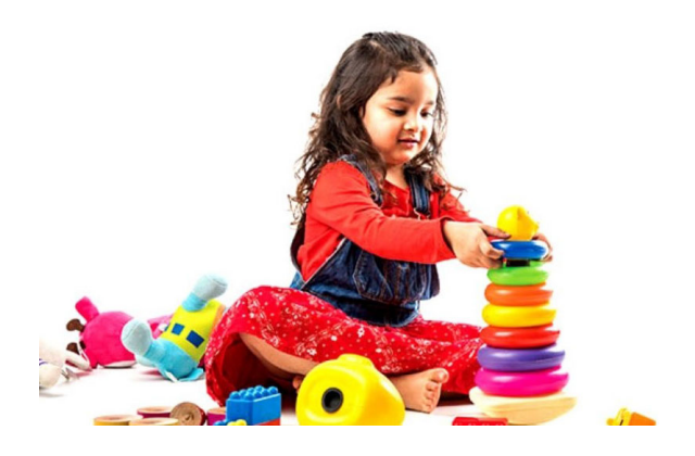
PRACTICAL KNOWLEDGE OF SURROUNDING