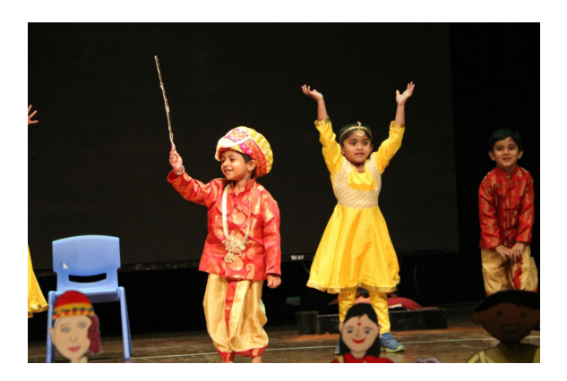
CONFIDENCE BUILDING AND STAGE EXPOSURE