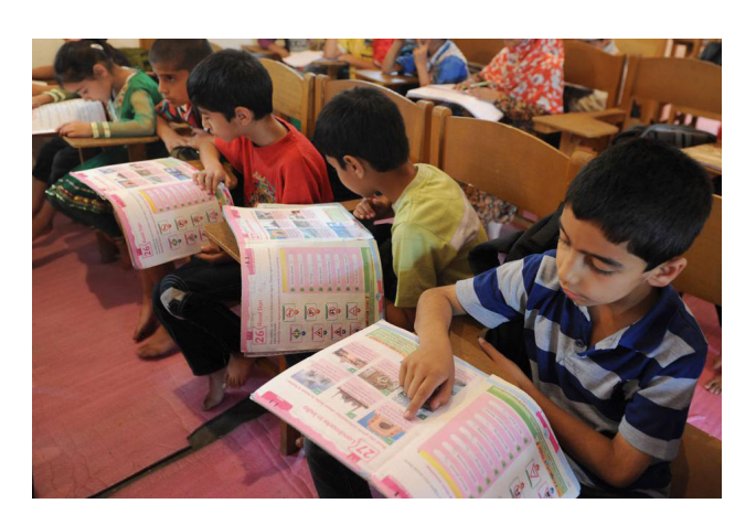
EXAM IN FRONT OF PARENTS