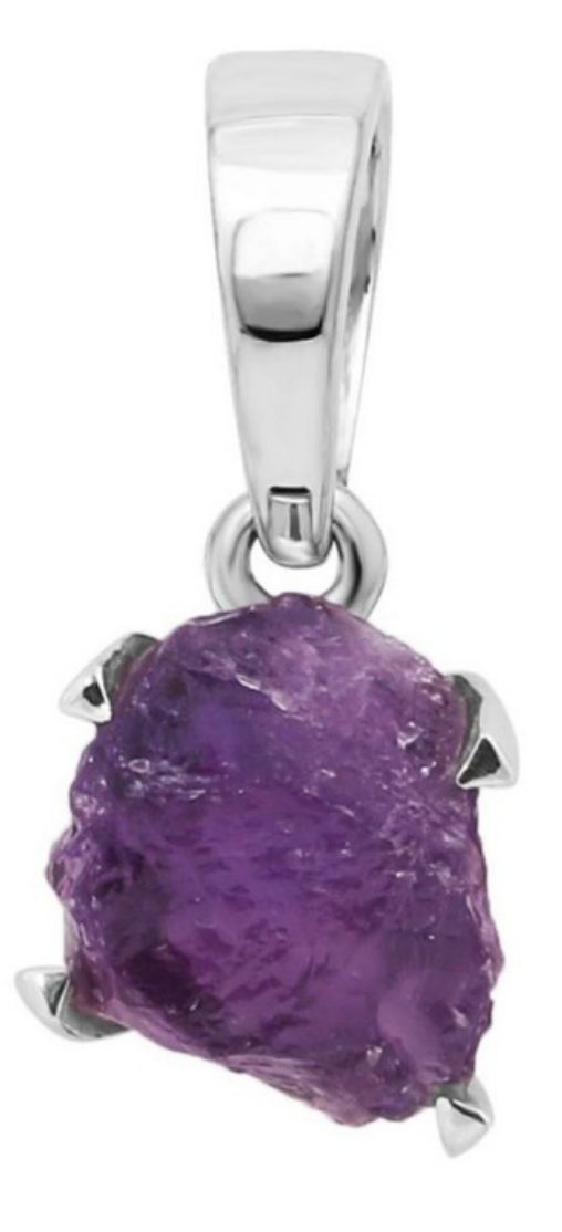
Amethyst Rough Pendant (AMT-1-5)